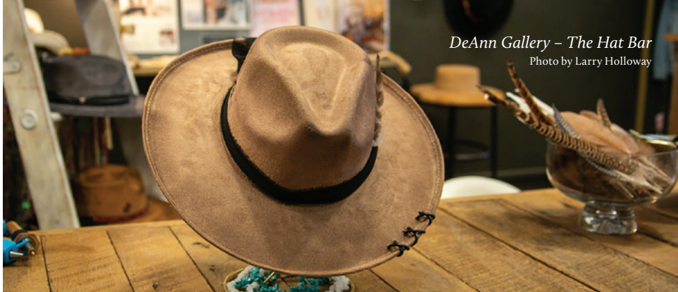
DeAnn Gallery – The Hat Bar